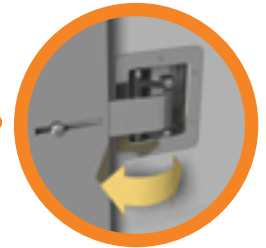
Vertical, Multi-Latch Closure