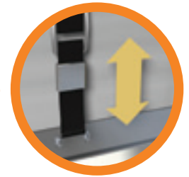
Buckle and Hook Fastener